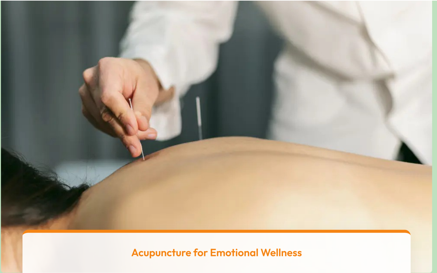
Acupuncture for Emotional Wellness