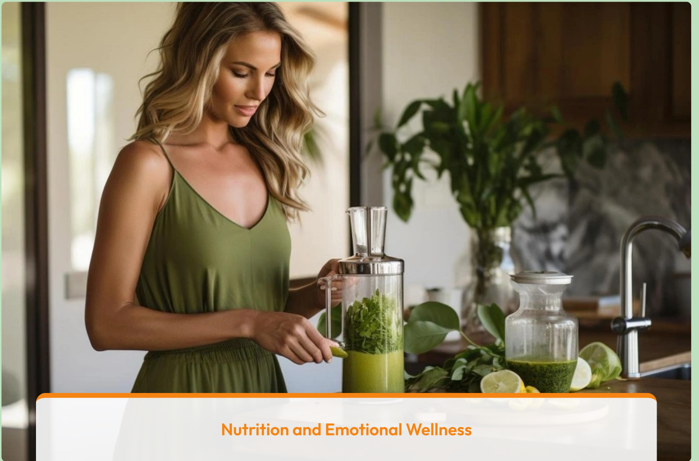
Nutrition and Emotional Wellness