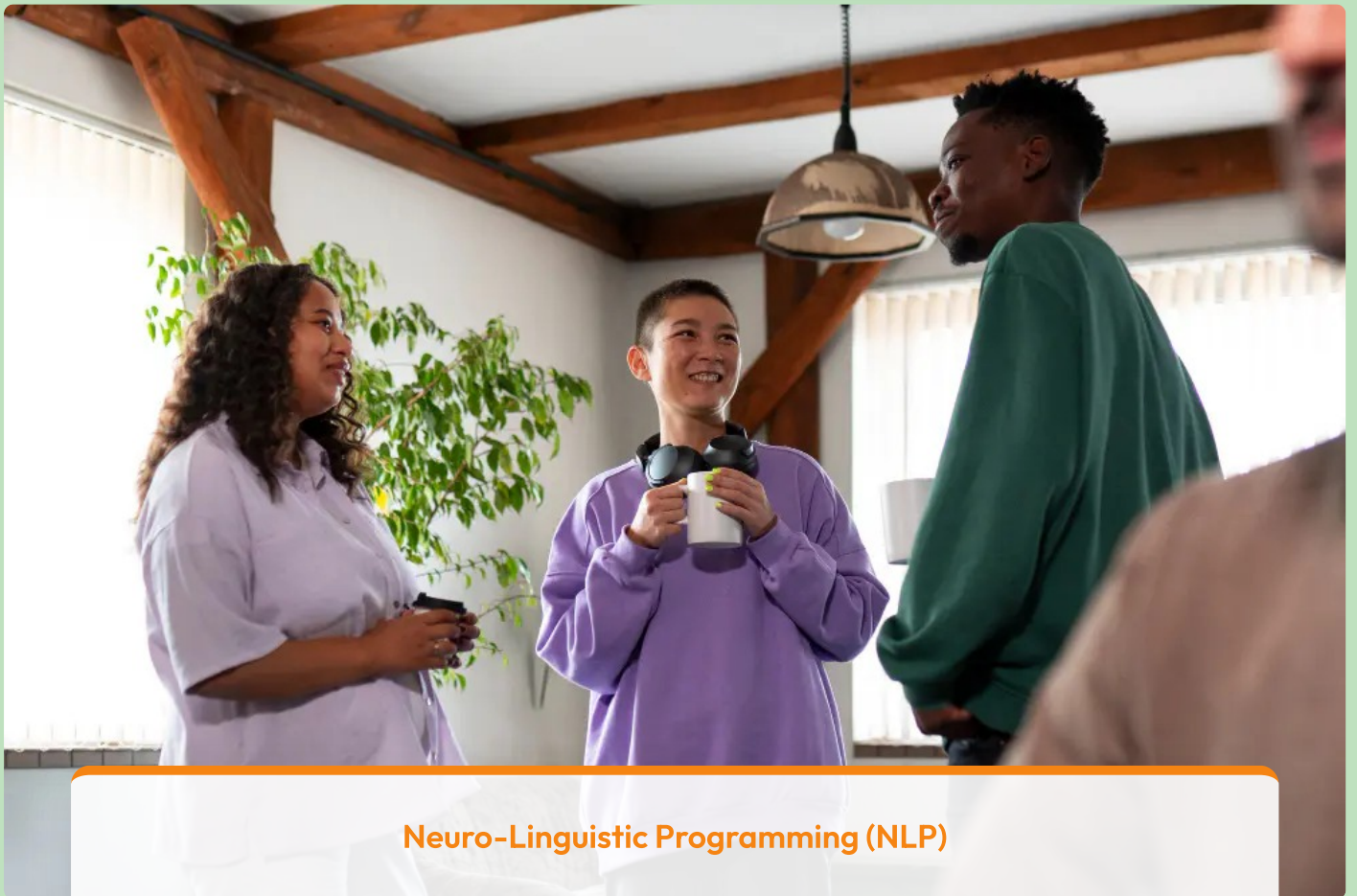
Neuro-Linguistic Programming (NLP)